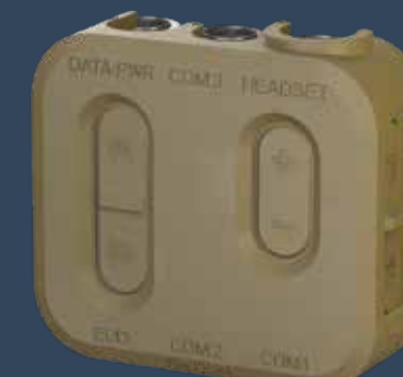
FalCom Hub Max