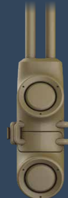
FalCom Dual Push

Back to basics with pure, ergonomic PTT functionality and seamless MOLLE integration for reliable frontline communication.