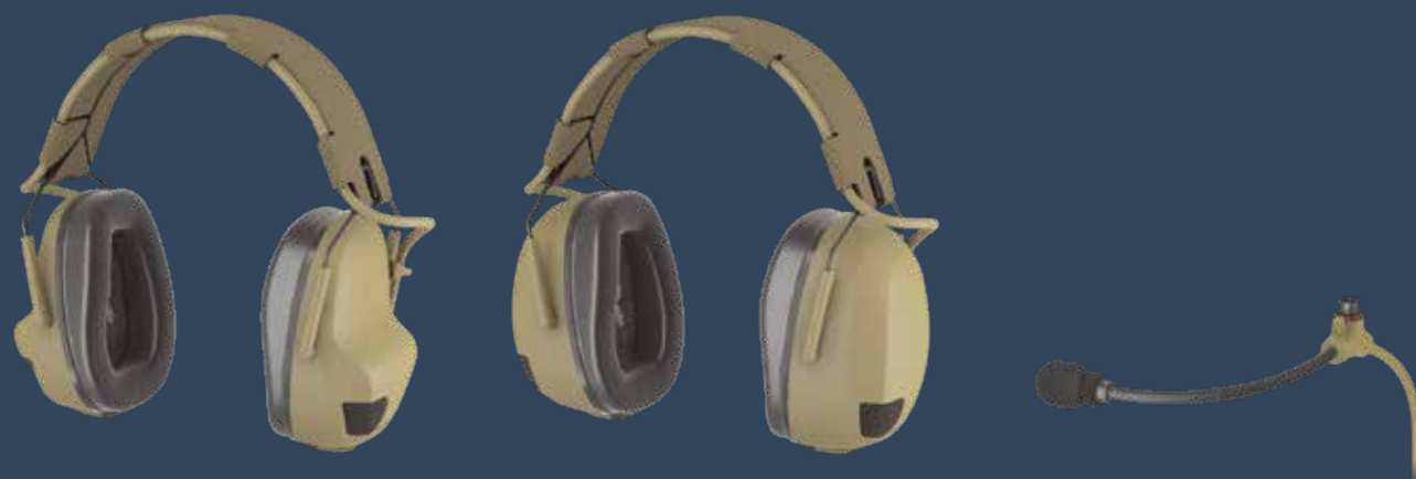
FalCom Pods Pro