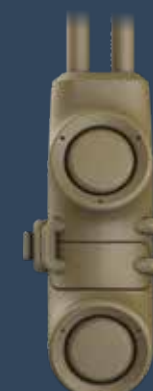
FalCom Dual Push