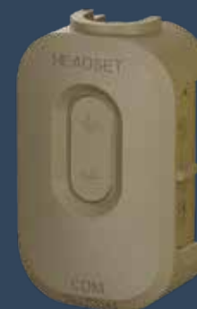
FalCom Hub Mini